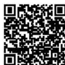
Parent and Carer